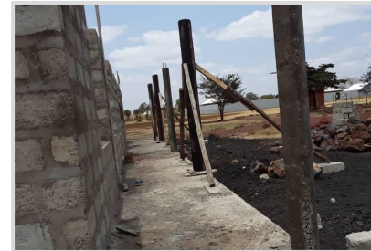
Constructing the walls