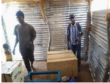
Arrived and ready to start