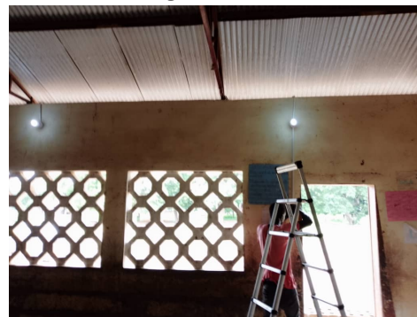
Light in the classroom

The solar engineers (CES Co Ltd) were very prompt. They collected the materials together, some from Dhaka, Senegal, and the works were progressed and completed very quickly.