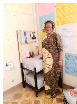
Batteries and controller

The television and DVD player were dispatched with a consignment of other supplies (clothing and educational materials) which departed Exeter on 21/09/2022. The TV and DVD will give the school access to much educational and entertainment material we have supplied to the other schools previously. We are currently sourcing more with the help of our supporting schools in the Exmouth area to follow as soon as practical.