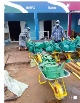
All collected in Wassu village and ready to go to the schools.