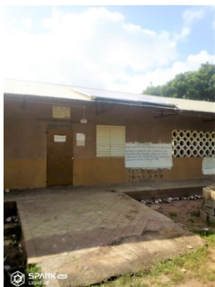
Panels on the roof