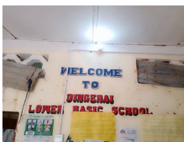
Light on the school signage

The solar engineers (CES Co Ltd) were very prompt. They collected the materials together, some from Dhaka, Senegal, and the works were progressed and completed very quickly.