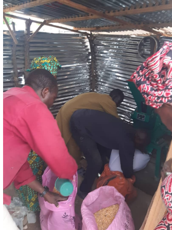
Ready and the first milling Happy ladies!