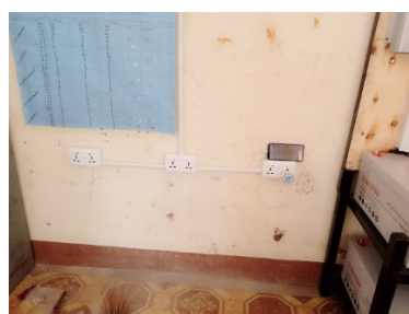
Power and USB connectors