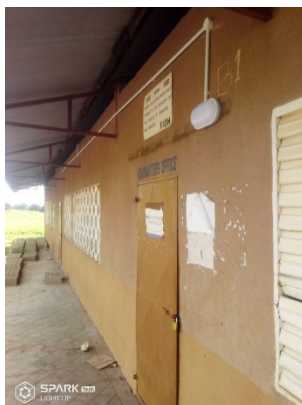
Lighting on the verandah