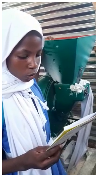
Even the schoolgirls were appreciative