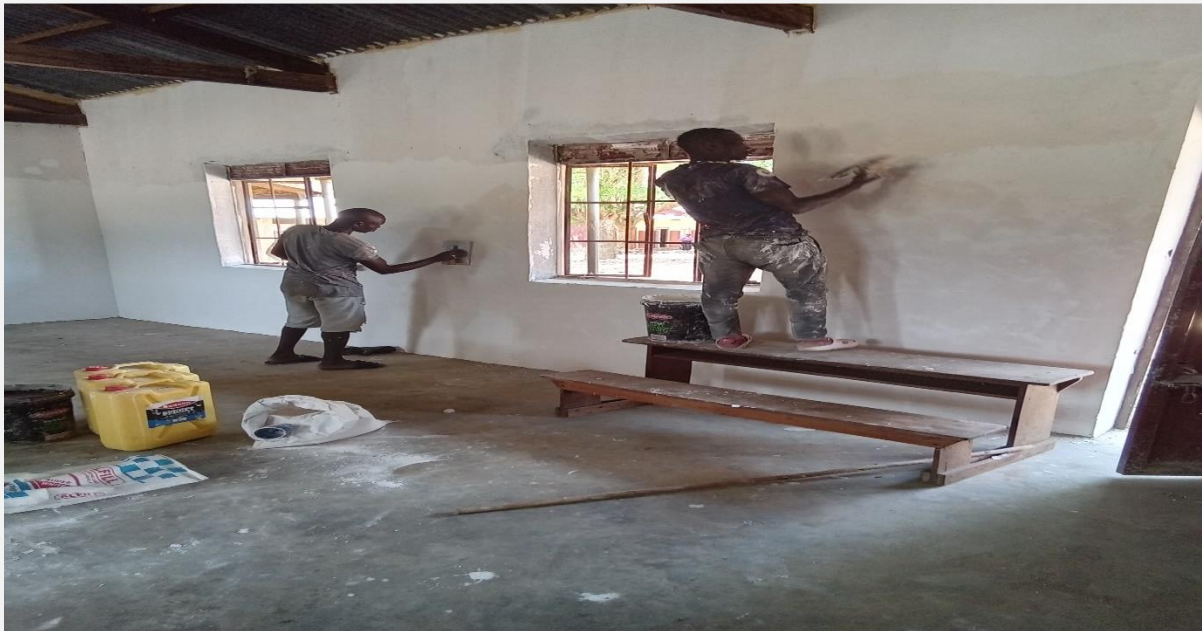
Painting in progress