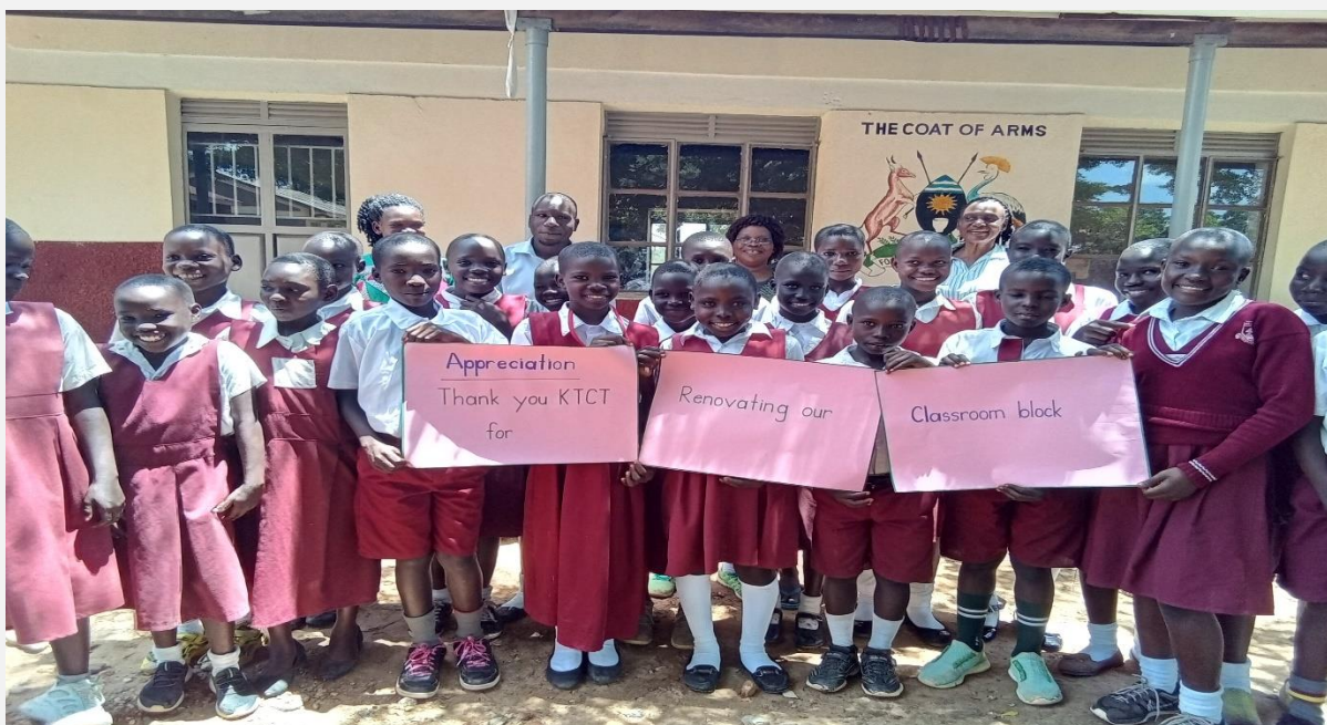
Pupils & teachers of Niva in front of the renovated classroom block