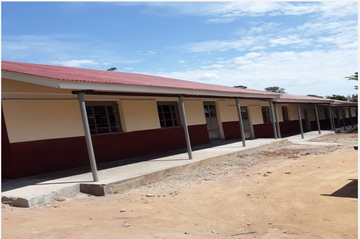
Completed front view of the classroom block