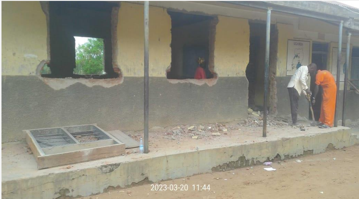
Removing old wooden doors & windows