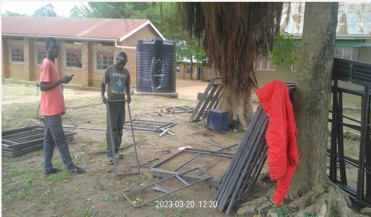
Welding doors & windows