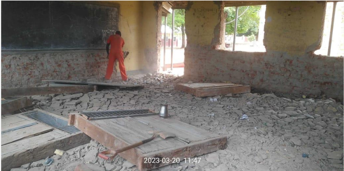
A mason removing old plaster on the floor & wall