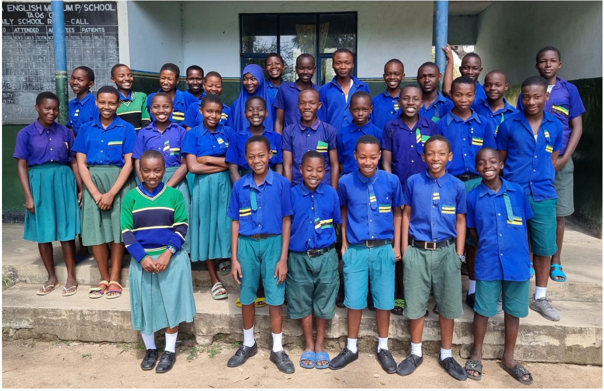
Class VII of 2022 just before their Primary School Leaving Exams