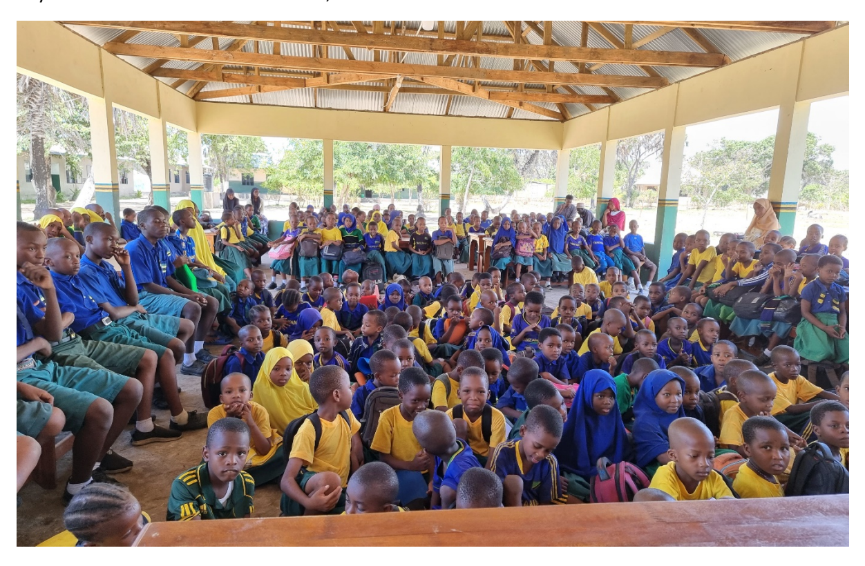
Goodbye from Choba Primary School!

The next year will be another exciting one, with the several Choba graduates completing their diplomas and looking for work, and about 20 more going on to tertiary education. All our students, from nursery to university, send a big thank you for your support – most of them would not progress beyond O level without it. Remember, we couldn't do what we do without our donors!